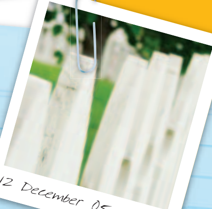
12 December 05 1101

Category: PANEL REPAIR SHOP Claim Type: Impact Date of Loss: 12/12/05 Location: Bellevue – Western Australia Report Method: Telephone Call to Claims Department Claims Officer: Narelle Sampson