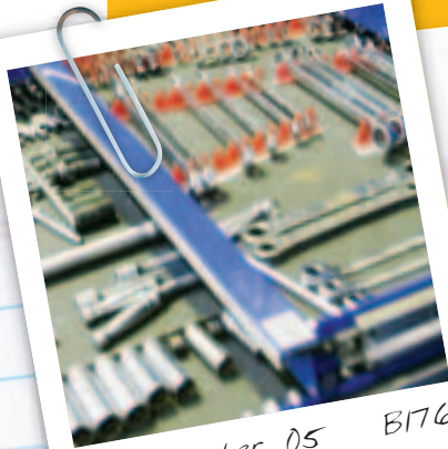
3 December 05 B776