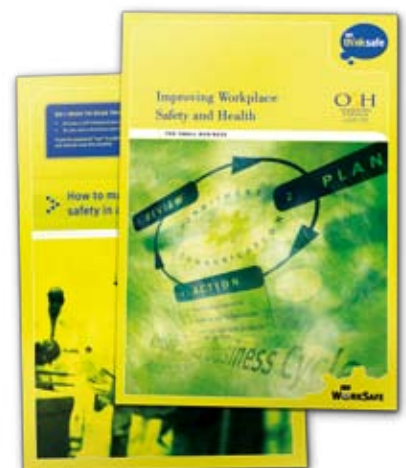
Safety tips courtesy of the NZACC.

If you need more help, the Motor Trade Association of NZ has a number of field staff available to assist its members. For more information phone 04 385 8859.